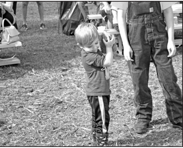
Stone Throwin' is an activity enjoyed by people of all ages.

While this year's festival may be over, those in the