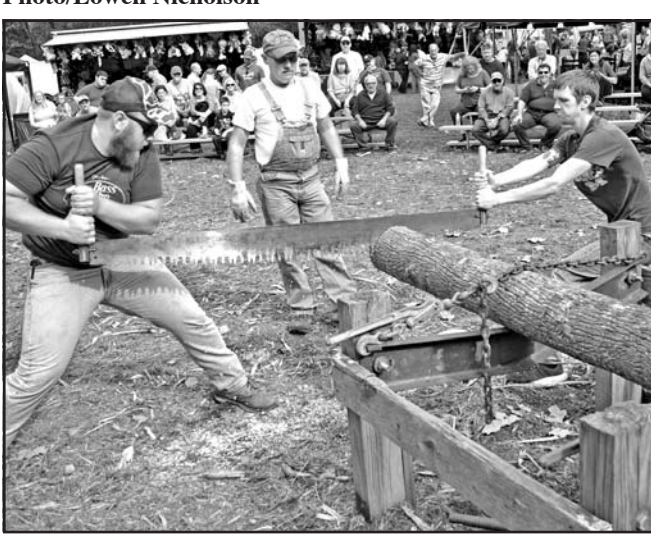
Log Sawin' is never easy, though some people make it look so.

Blairsville Sorghum Festival Club have already started preparing for next year's festivities, booking bands, taking vendor applications and gearing up for the 49th year of the festival in 2018.