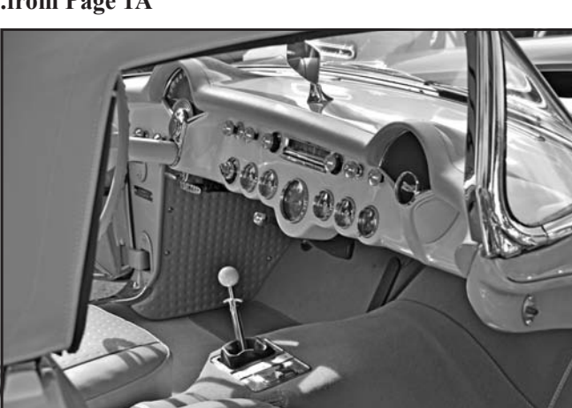
Who doesn't love a classic car?

Some in attendance were members of local car clubs that brought multiple vehicles and have been doing so for years. One such club was "Classic American Rides" out